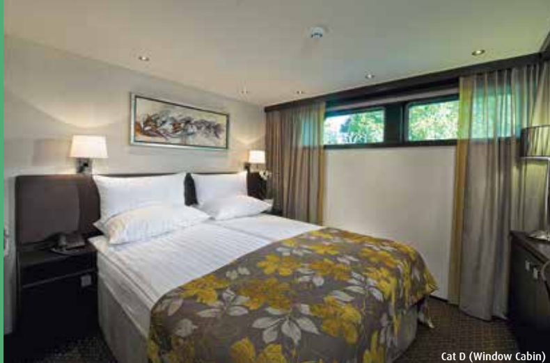
Cat D (Window Cabin)