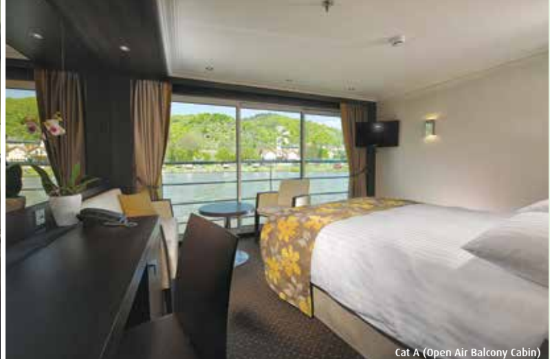
Cat A (Open Air Balcony Cabin)

in the ancient city centre. Visit Begijnhof, the most beautiful and oldest hidden courtyard in Amsterdam and see impressive buildings like the Royal Palace and the New Church (over the famous Dam Square), but also other spectacular locations like ancient courtyards and secret churches. You will understand why the canal houses are so famous and you will be amused by the history and beauty of the Canal Ring - a World Heritage site recognised by UNESCO. We then go to the Jordaan neighbourhood with its beautiful old houses, cute canals and tiny bridges, there you will visit some hofjes, old hidden courtyards which are a travel in time before finishing our tour at Anne Franks House. This afternoon board our luxury ship Avalon MS Expression and meet our crew at an evening welcome reception.